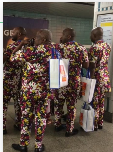
Rotarians from Africa at the Hamburg Convention in 2019

The opportunity is there for all of us to share in the excitement of RICON 23, even if it is not possible to attend the Convention itself. Volunteers are needed for a vast array of jobs and this opportunity is open to Rotarians, friends and family. If the task is inside a Convention venue, volunteers will need to be registered for the Convention, but there are many other roles that will be required for jobs outside the venues.